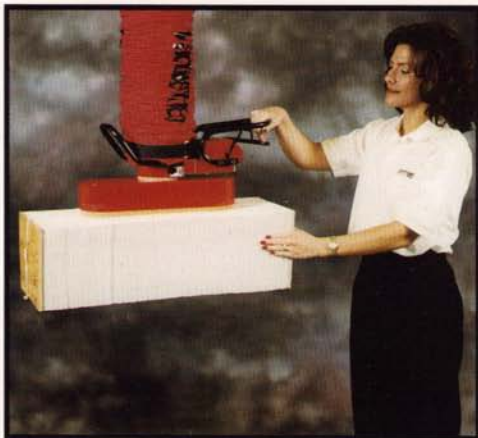
Signature Log Horizontal