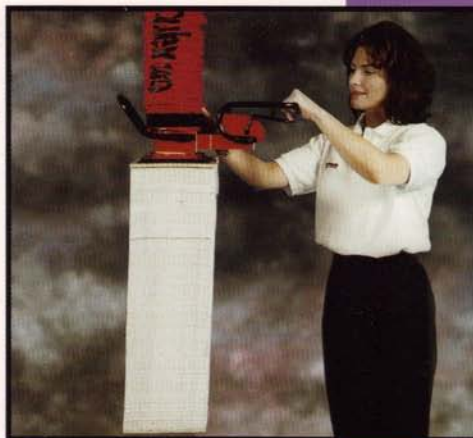
Signature Log Vertical