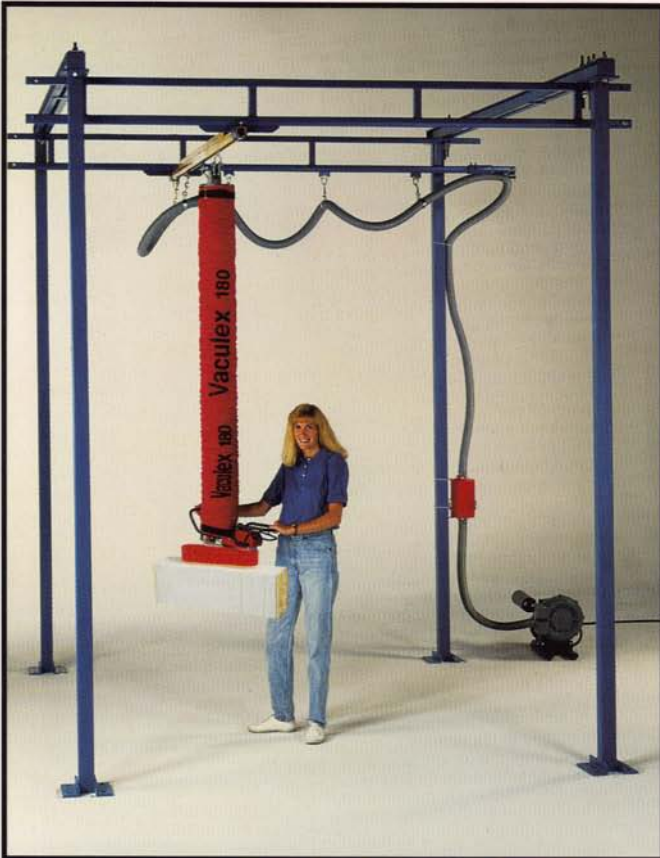
Vaculex Vacuum Lift & Free Standing Bridge Crane

T he Vaculex Vacuum Lift creates an efficient, ergonomically-designed workplace where operators safely lift, transfer and position signature logs in the pressroom or bindery.