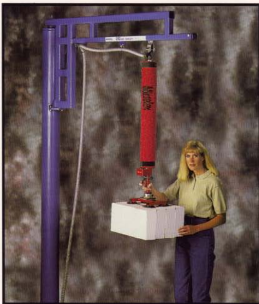
Microlex Vacuum Lift & Jib Crane

V aculex offers superior lifting power for the heaviest of signature logs on the backbone, lap, head, foot, or endboard. Vaculex is ideal for logs horizontal or vertical.