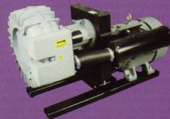
High Efficiency Pump Field Rebuildable