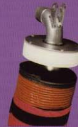
Threaded Tube Connectors Prevent Leakage Patented by Vacutrade