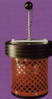
Endboard Safety Valve Patented by Vacutrade